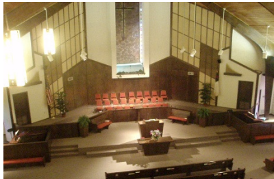
View of the Sanctuary

You don't need to "dress up" to worship God. Wear the clothes that you feel comfortable in. There is no dress code at Immanuel Southern. A seminary degree isn't necessary to understand the